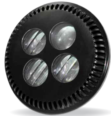
Part No 751-1018-001