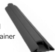
Rub Strip and Rub Strip Retainer