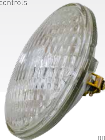
BDSI - A

Manufactured under strict quality controls