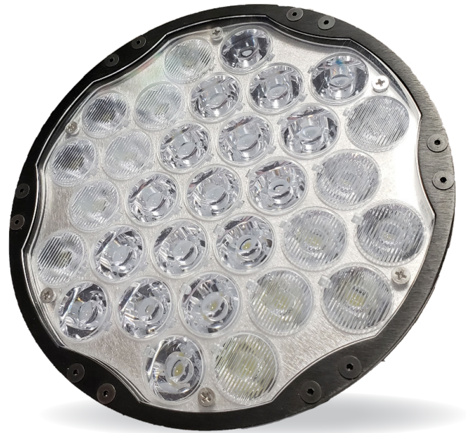
Part No 751-1022-002

Contact your Boeing Distribution Services representative to find out more, or contact us at Customer.Questions@BoeingDistribution.com