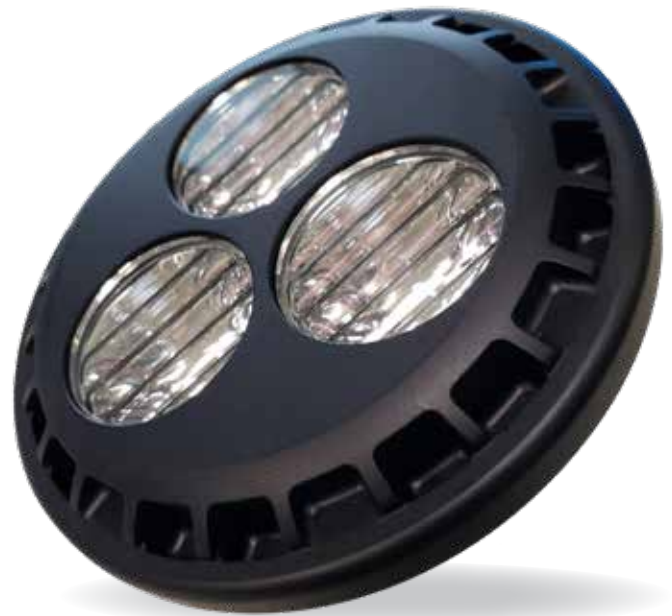
Part No 751-1021-002

Additionally, Hoffman's PAR36 LED offers an extremely long service life with multiple high powered LEDs. With these high color temperature LEDs, Hoffman's PAR46 LED Light provides superior visibility and color rendering. This solid-state solution is resistant to the effects of shock and vibration that can contribute to the reduced service life of the 4626 series lamp.